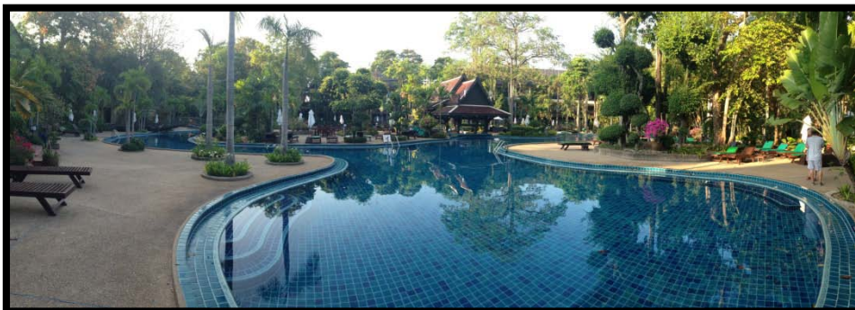
Accommodation in Pattaya